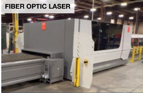
FIBER OPTIC LASER