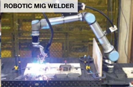
ROBOTIC MIG WELDER